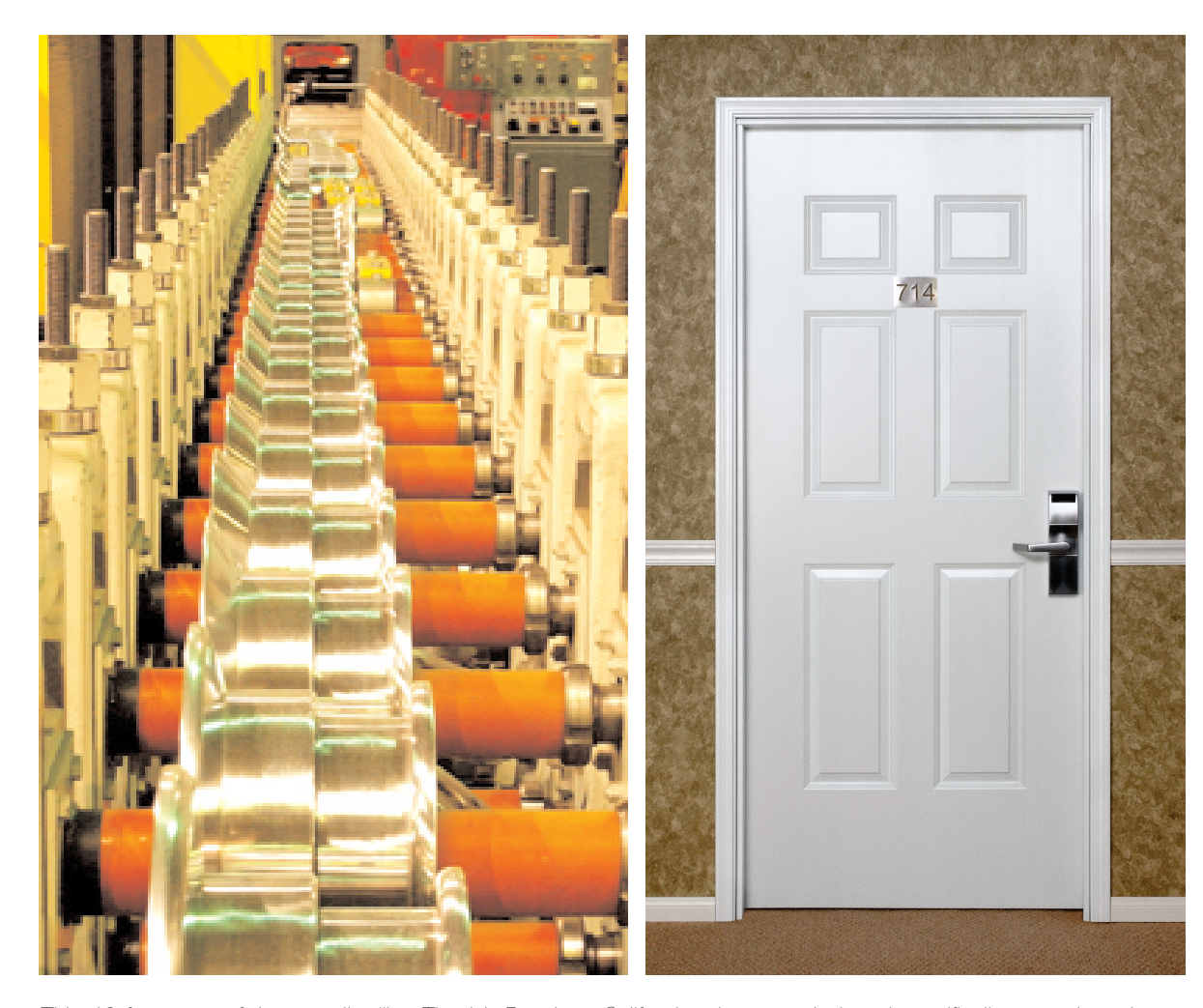
This 43 foot state-of-the-art roll mill at Timely's Pacoima, California, plant was designed specifically to produce the Frame-Up adjustable kerf steel door frame. Timely, an industry leader for over 30 years, is recognized as the originator of the prefinished drywall frame concept and widely respected for its innovative ideas, products and applications.